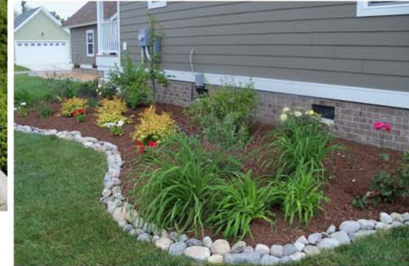
Example river rock lined grass*