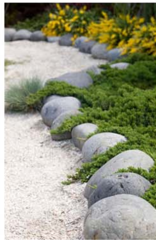
Example river rock lined paths with DG (decomposed granite)*

*Pictures from internet for example only.